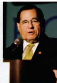
Rep. Jerrold Nadler